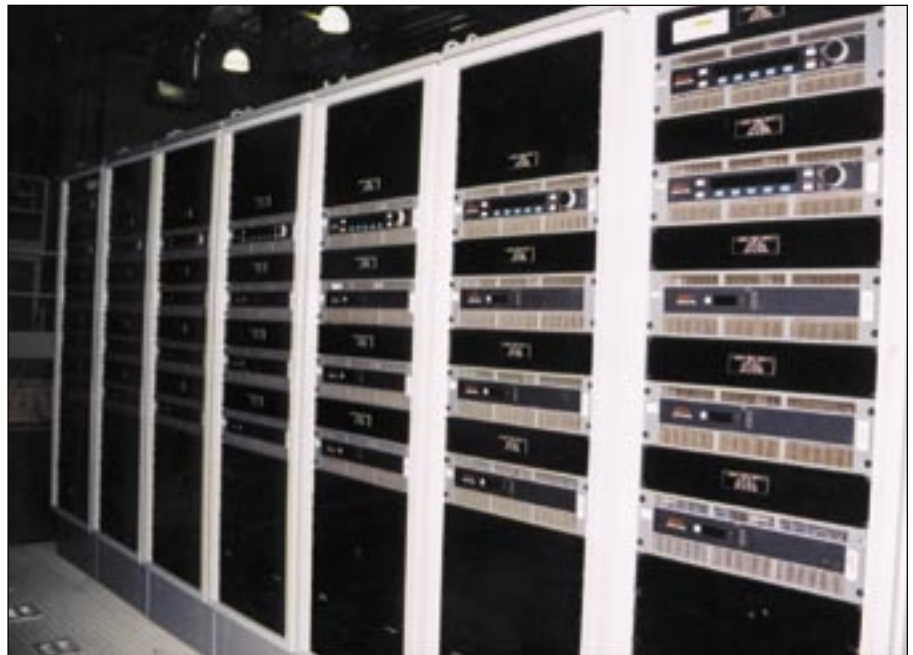
Racks of Pinnacle power supplies used in master/slave configurations

Pinnacle units are CE marked and conform to Low Voltage Directive 73/23/EEC and Electromagnetic Compatibility Directive 89/366/EEC—meeting EN55011 (emissions), EN61000-6-2 (immunity), and EN50178 (safety). Select units also carry NRTL certification.